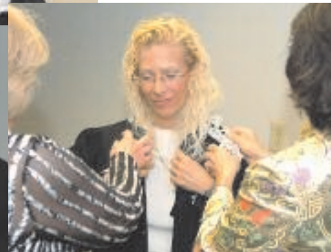
Circuit Judge Merrilee Ehrlich