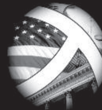
Exhibit Boards Graphics & Animations Electronic Trial Presentation Focus Groups / Mock Trials

Ft. Lauderdale (954) 735-4189 Miami (305) 231-1100 Nationwide (800) 395-7994 www.trialcs.com